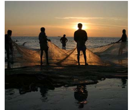
Fishermen pulling in their nets on St. Martin's Island

Finally we got onto the ship that boarded from Teknaf to go to St. Martin. A group of young boys were merrily singing away ethnic Bengali songs. After about two hours, the captain announced that we were going to enter the Bay of Bengal, which fell to our right. Within seconds, everyone proceeded to the right end of the ship causing the vessel to tilt ever so slightly. Although risky, it showed the passengers' enthusiasm to take in the beautiful sight they were approaching. The difference in color of the river and the bay waters was very distinct, the Bay of Bengal being a deeper shade of blue.