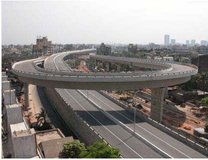
1.9 km long Flyover at Khilgaon Rail & Road Intersection in Dhaka City

years since I'd gone home last, and yet I almost didn't recognize Dhaka city, which now had flyovers, a theater inside a mall, and a sushi restaurant! Three weeks was just not enough to catch up on all the new hot spots in town.